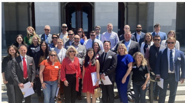
Ag Council Legislative Conference attendees gather on the steps of the State Capitol.